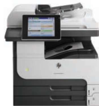
(HP LaserJet Enterprise MFP M725dn shown)

Mobile printing capability: HP ePrint, Apple AirPrint™