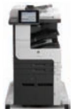
HP LaserJet Enterprise MFP M725z+