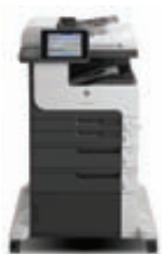
HP LaserJet Enterprise MFP M725f