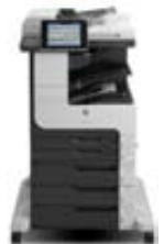
HP LaserJet Enterprise MFP M725z